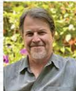
Executive Director, CAVU